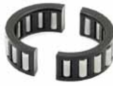
9-51207 Bearing, Center Main Replaces: Mercury 31-88269T Fits: 250, 275, 3.4L