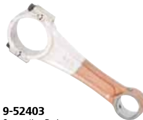
9-52403 Connecting Rod Replaces: Yamaha 6E5-11650-01 Fits: V4/V6 w/21.5 mm wrist pin