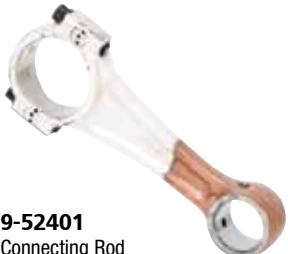
9-52401 Connecting Rod Replaces: Yamaha 688-11650-03 Fits: 7580/90 hp 3cyl.