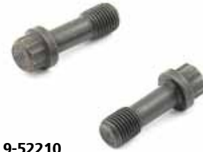
9-52210 Bolt, Connecting Rod (2/pkg) Replaces: Mercury 10-93886 Fits: V-6 Bottom guided pistons