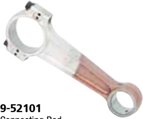
9-52101 Connecting Rod Replaces: Johnson/Evinrude 395861 Fits: 30-60 hp