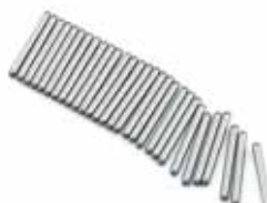
9-51213 Bearing, Wrist Pin Replaces: Mercury 29-818291, 29-818391001 Fits: Top-Guided Piston