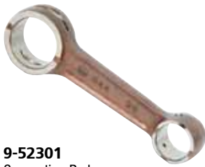
9-52301 Connecting Rod Replaces: Suzuki 12161-94400 Fits: 40 hp