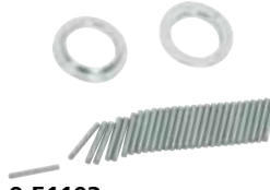
9-51103 Bearing, Connecting Rod Replaces: Johnson/Evinrude 395627, 388595 Fits: Piston End 18-235 HP V-6