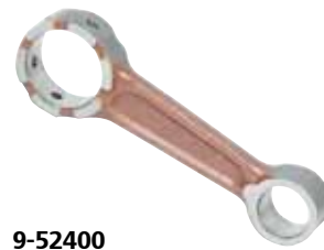
9-52400 Connecting Rod Replaces: Yamaha 650-11651-04 Fits: 15 hp