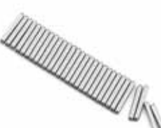
9-51214 Bearing, Wrist Pin Replaces: Mercury 29-822553 Fits: V-6 Top-Guided Piston