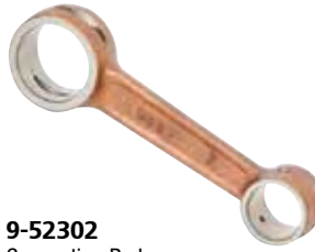
9-52302 Connecting Rod Replaces: Suzuki 12161-96300 Fits: 30 hp 2cyl Up to 1987