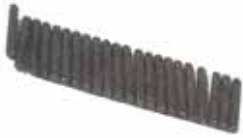
9-51101 Bearing, Connecting Rod Replaces: Johnson/Evinrude 393283 Fits: Piston End 9.9/15 HP