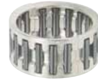
9-51100 Bearing, Connecting Rod Replaces: Johnson/Evinrude 387787 Fits: Crank End V-4, V-6 Crossflow & 60 Degree Engines