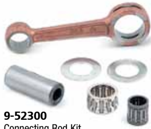
9-52300 Connecting Rod Kit Replaces: Suzuki 12161-93902 Fits: 15 hp