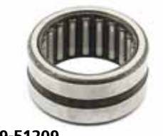
9-51209 Bearing, Lower Main Replaces: Mercury 31-74248T Fits: 1.500" OD V135/V150/V175/V200 Carb