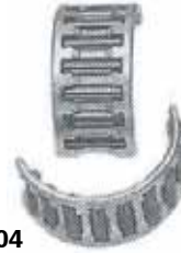
9-51104 Retainer Set Replaces: Johnson/Evinrude 396041 Fits: V-4 / V-6