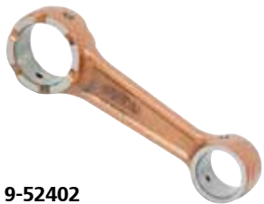
9-52402 Connecting Rod Replaces: Yamaha 689-11651-00 Fits: 30 hp