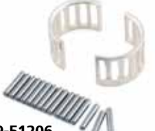
9-51206 Bearing, Connecting Rod Replaces: Mercury 31-43012A1 Fits: 70, 75, 80, 90, 100, 115, L3, L4, 3.0L