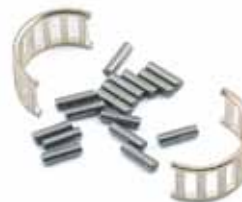
9-51211 Bearing, Connecting Rod Replaces: Mercury 31-62596A1