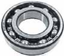
9-51106 Bearing, Lower Main Replaces: Johnson/Evinrude 385503 Fits: V4 & V6