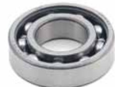
9-51203 Bearing, Upper/Lower Main Replaces: Mercury 30-64424T Fits: 50/60/65/70