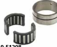
9-51208 Bearing, Center Main Replaces: Mercury 31-67445 & 31-88903T Fits: Older V-6 135-200hp