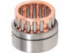
9-51215 Bearing, Center Main Replaces: Mercury 31-16756A6 Fits: V-6 1.375" OD x 3.318" OD