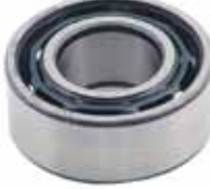
9-51201 Bearing, Upper Main Replaces: Mercury 30-62567T Fits: 75/80 4cyl, 90/115/140 inline 6 cyl