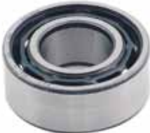
9-51204 Bearing, Lower Main Replaces: Mercury 30-67923T Fits: V6