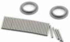
9-51210 Bearing, Wrist Pin Replaces: Mercury 29-88258 / 29-88258001 Fits: 3.0L V-6