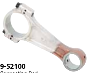
9-52100 Connecting Rod Replaces: Johnson/Evinrude 394462 Fits: 40-70 hp