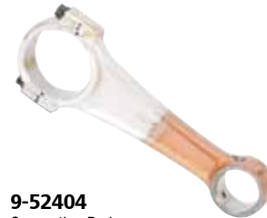
9-52404 Connecting Rod Replaces: Yamaha 6R5-11650-10 Fits: V4/V6 w/23 mm wrist pin