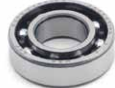
9-51105 Bearing, Lower Main Replaces: Johnson/Evinrude 330854 Fits: 25-35 hp