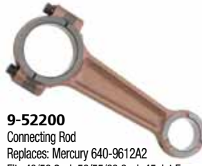
9-52200 Connecting Rod Replaces: Mercury 640-9612A2 Fits: 40/50 2cyl. 50/55/60 3cyl. 45 Jet Force 40/50/120 1996-97, Sportjet 95, 120XR 1996-97