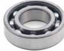
9-51202 Bearing, Upper/Lower Main Replaces: Mercury 30-63742T Fits: 115/140/150 inline 6cyl, 30/40/50/60/75/80