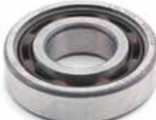
9-51200 Bearing, Lower Main Replaces: Mercury 30-43011T Fits: 75/90/100/115