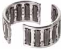
9-51102 Bearing Set Replaces: Johnson/Evinrude 395401 Fits: Center Main 9.9/15 HP