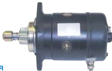
18-6431 OUTBOARD STARTER Replaces: Tohatsu 346-76010-0A0 Fits: 2cyl Engines 40C, 50C & 50A, 70A, NS25C, NS30A, NS35C, NS40C