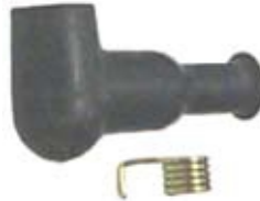
18-5750 18-5750-9① UNIVERSAL SPARK PLUG BOOTS Supplied complete w/Terminal Connector