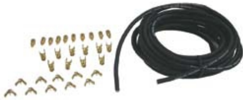
18-5225 SPARK PLUG WIRE KIT Kit includes 25 ft. Roll of 7 MM Hypalon Ignition Wire With a Metallic Core and a Large Assortment of Three Different End Fittings to Fit Outboard Motors.