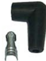
18-5752 UNIVERSAL SPARK PLUG BOOT 8mm