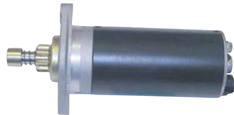
18-6430 OUTBOARD STARTER Replaces: Tohatsu B29A-90500A Fits: 1981-on 2WT60A