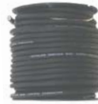
18-5226 IGNITION WIRE Metallic Core 100' Spool 7mm Hypalon