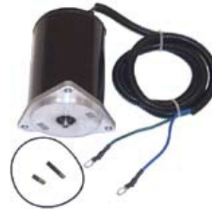
18-6786 TILT/TRIM MOTOR 40-50HP, 2 wire hook up 3 bolt flange