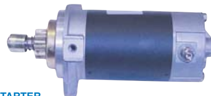
18-6432 OUTBOARD STARTER Replaces: Tohatsu 3C8-76010-1 Fits: M50D, M60B, M60C, MD40D, MD50A MFS25A, MFS30A, NS40D, NS50D, NS60C, NS70B, NS70C, NSD25A, NSD30A, NSD50A