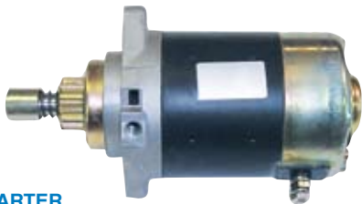
18-6418 OUTBOARD STARTER Replaces: Tohatsu 353-76010-4 Fits: M45A2, M50C, M60A, M70A2, M90A, M140A, NS45A2, NS50C, NS60A, NS70A2, NS90A, NSD90A, NS120A, NS140A (9 Tooth)