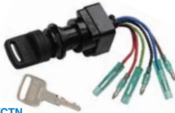
MP51070 – CLAMSHELL MP51072 – BULK 100 PCS/CTN IGNITION SWITCH Nissan-Tohatsu 2 & 4 Stroke Replaces: 385-76020-1 Colors on wires match factory color codes